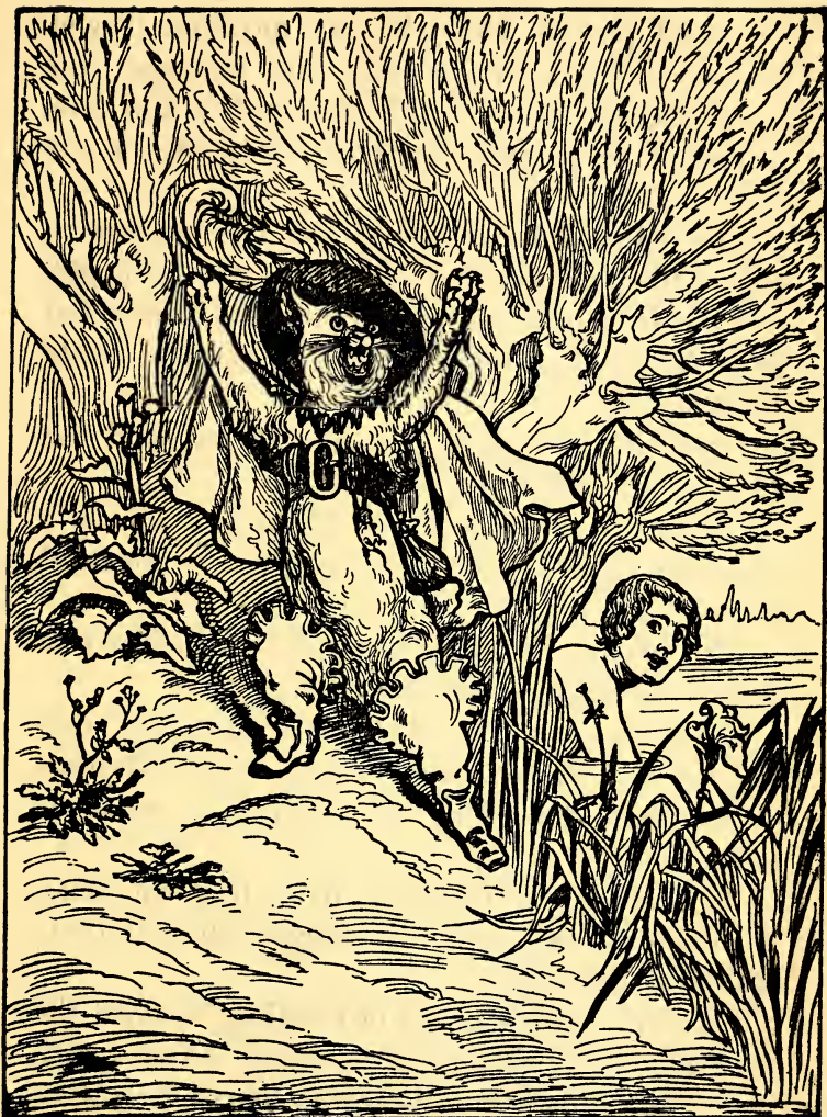
"THE MARQUIS OF CARABAS IS DROWNING!"